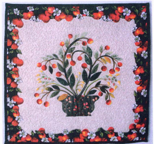
Pattern by Elly Sienkiewicz Block Size: 18" X 18"

Contact Sharon Howe, 208-772-5441 for sign up sheets and a list of supplies that you will need to bring to class. Hope to see you all there!